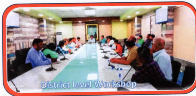
District level Workshop