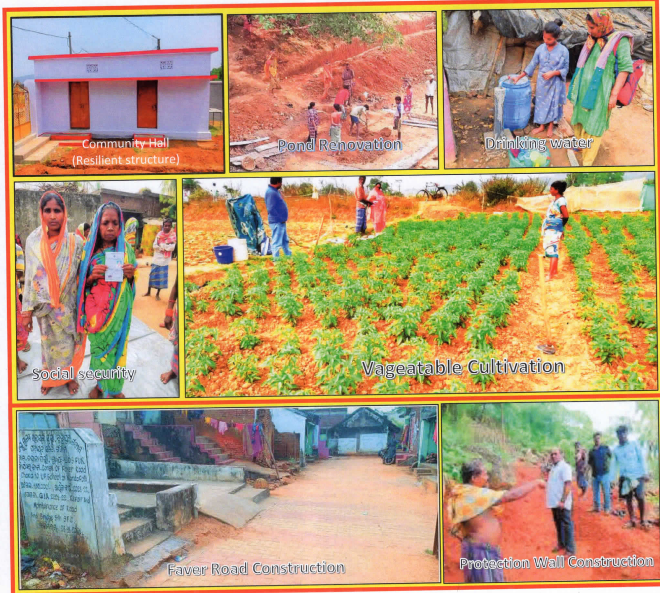
Community Hall (Resilient structure)