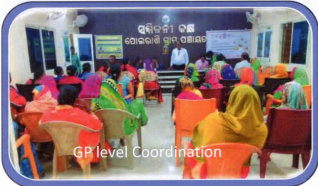
GP level Coordination

The SWAD has organized two Gram Panchayat Level, one Block Level and two District level meetings, Workshop, and consultation with different stakeholders to share issues of the community and liaison with the existing Govt. schemes with vulnerable communities to reduce the risk of the person, family, and community. The vulnerable community participation in decision-making was increased and the Community leaders PRI members were mobilizing Govt. resources in the operation area.