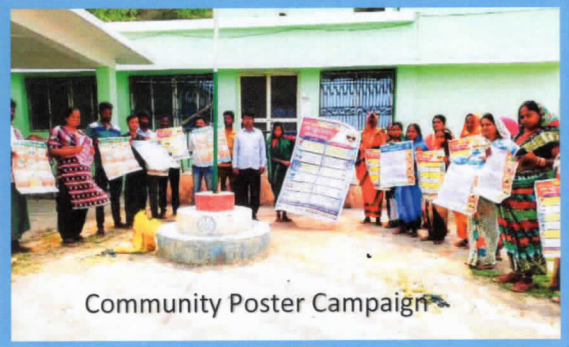
Community Poster Campaign