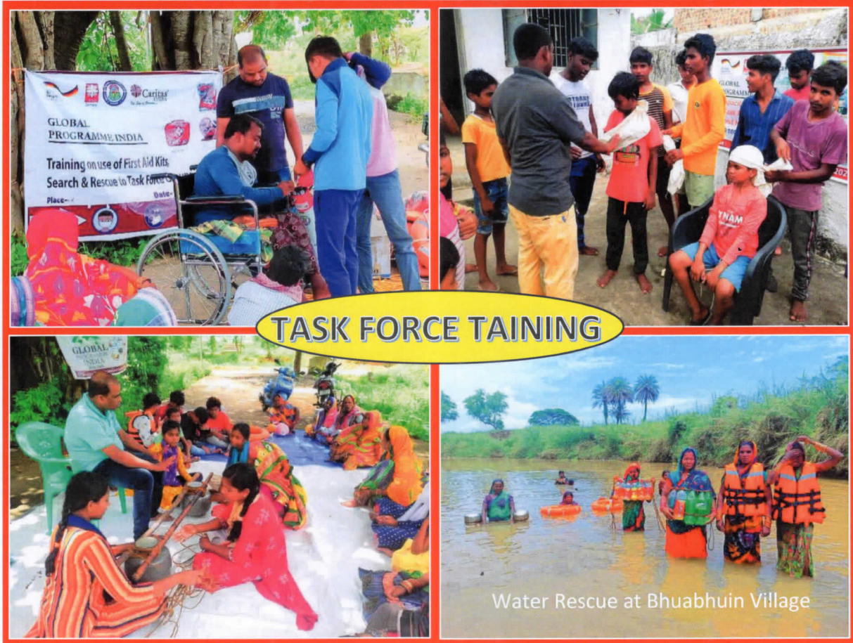
TASK FORCE TRAINING

The Community people have actively participated in the task force training and SWAD has formed different committees in the village, they are aware on their role and responsibilities. Conducted trainings on search and rescue as well as on use of fist aid kits during emergency.