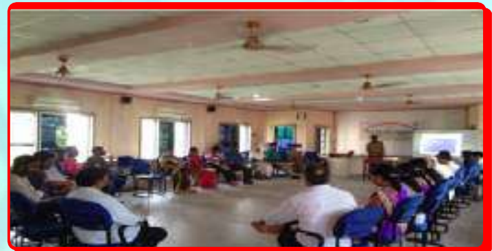
Peace Training for Peace Core Team of Experts