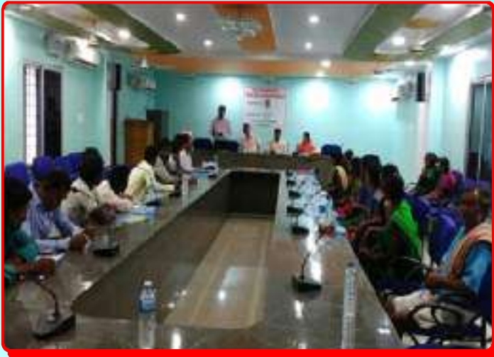
SWAD Peace Network Meeting